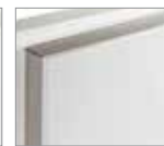
White with Metallic