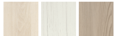
Antler Icy Avalanche Linea Nightfall Wharf (Textured)