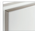
White with Metallic