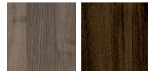
Elk (Textured) Gunstock (Textured)